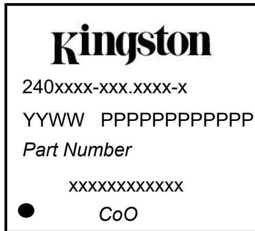
Figure 4 - EMMC Package Marking