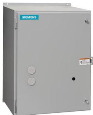
Contactor LE,300a,0NC,3NO,208V Contactor LE,300a,0NC,3NO,208V