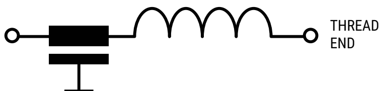
Typical Electrical Schematic