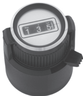
23-1-21 Projecting L. 31.5 mm