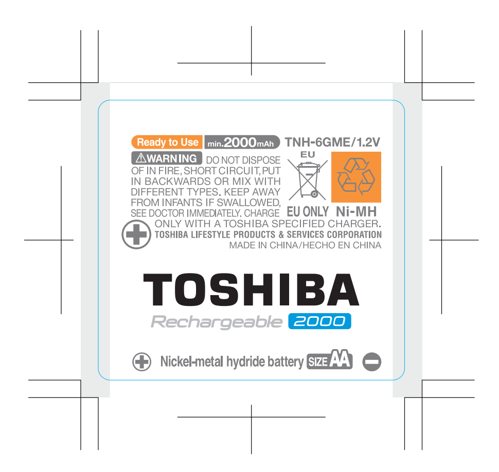
(Fig-2) Product label