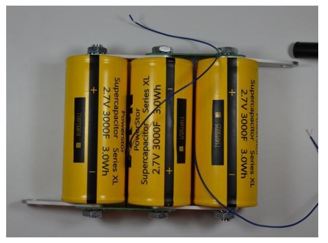
Figure 3. Assembled cells with lock washer and nuts

2. The balance PCB is placed on the opposite side of the buss bars facing away from the cells. The polarity marked on the PCB must match the polarity of the threaded terminal. Place a lock washer over each threaded terminal and hand tighten the nut. When assembled properly, each side will alternate between a buss bar and PCB board as shown in Figure 3.