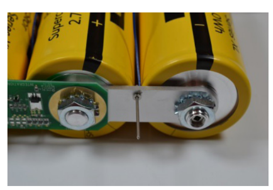
Figure 4b. Insert rivet