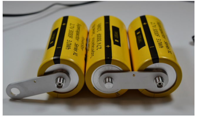
Figure 2. Connect cells in series. Polarity located on the black stripe

1. Connect the cells in series. Line alternating positive and negative terminals, then place buss bars over threaded terminals. The polarity of the terminal can be seen on the black stripe on the side of each cell as shown in Figure 2.