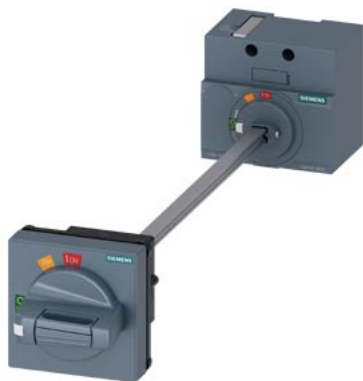
door mounted rotary operator standard IEC IP65 with door interlock accessory for: 3VA51