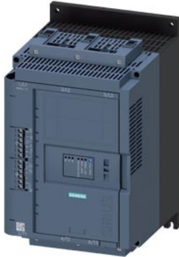
SIRIUS soft starter 200-480 V 47 A, 110-250 V AC Screw terminals Thermistor input