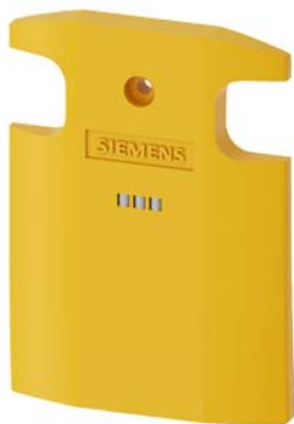
LED cover yellow for position switch metal 3SE51, Enclosure 56 mm wide 2 LEDs, yellow/green, 110-230 V AC