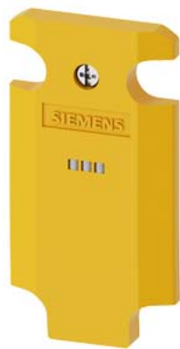
LED cover yellow for position switch plastic 3SE5132 enclosure, according to EN 50041 2 LEDs, yellow/green, 24 V DC