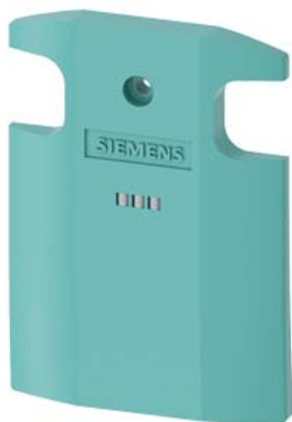
LED cover for position switch Metal 3SE51 2 LEDs, yellow/green, 24 V DC Color turquoise