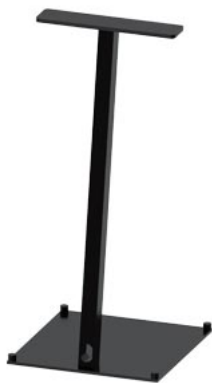
Stand for two-hand operation console, with cable cut-outs for metric screw connections