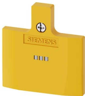
LED cover for position switch for plastic enclosure 50 mm LEDs, yellow/green, 24 V DC Color yellow