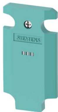
LED cover, Color turquoise for position switch Plastic 3SE5132, with 2 LEDs, yellow/green, 230 V AC