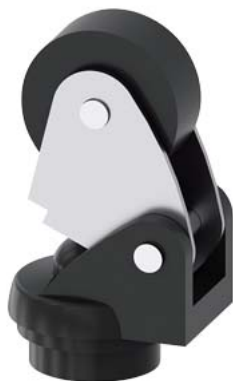
Actuator head for position switch 3SE51/52 EN 50041, Roller lever Metal lever and Plastic roller 22 mm