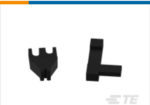
TE Part #240825-3 PLATE-STRIP HOLD DOWN