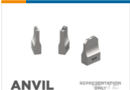
TE Part #1803432-1 ANVIL, AMPLIVAR FLAT PROFILE