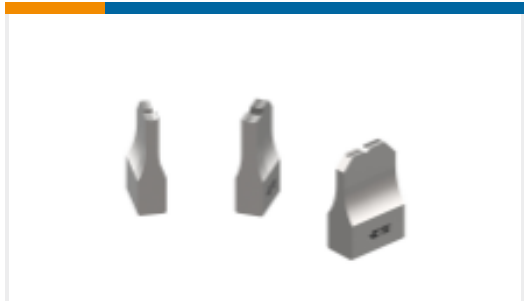
TE Part #2-1803059-1 ANVIL COMBINATION, END FEED