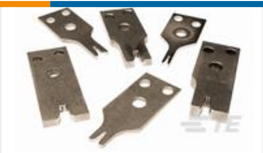
TE Part #1-456404-0 CRIMPER WIRE .070 F