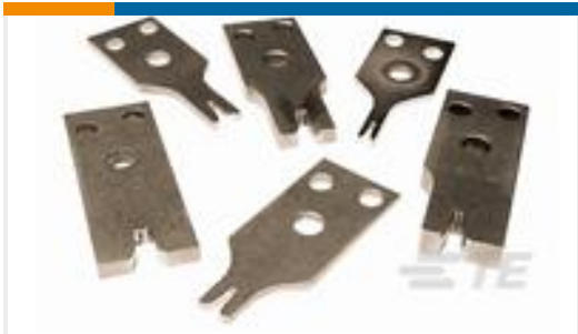
TE Part #2-2119582-6 Crimper, Insulation F Premium