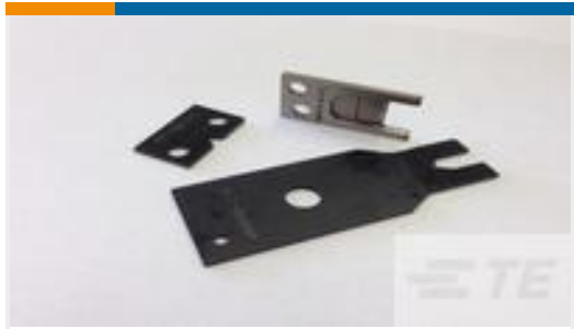
TE Part #690474-8 SHEAR BLADE