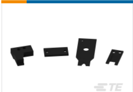
TE Part #240644-1 PLATE-REAR SHEAR