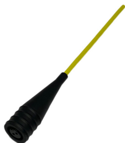
CMCP602HST Series 2 Socket Push on High Temperature Cable Assembly