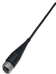
CMCP602L Series 2 Socket Locking Collar General Purpose Cable Assembly