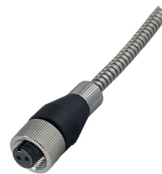
CMCP602A Series 2 Socket Locking Collar, Armored Cable Assembly