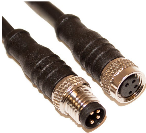
MALE FACE VIEW

(M8 Cordset, 4 Position, 24 AWG Unshielded PVC, Male Straight to Female Straight)