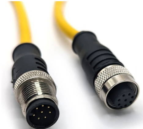
MALE FACE VIEW

(M12 Cordset, 8 Position, 24 AWG Shielded, Male Straight to Female Straight)