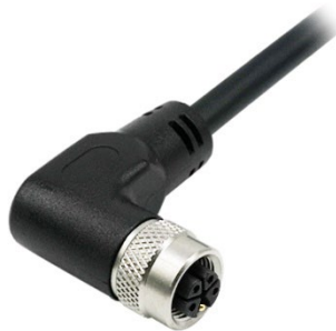
FEMALE FACE VIEW

(M12 Cordset, 5 Position, 16 AWG Unshielded, Female 90° to Free End)