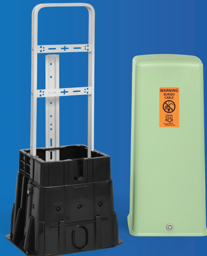
Model CVK101035A Universal Split Base Pedestal

These pedestals can also be equipped with up to six (6) splice trays for 12, 24 and 48 fibers including ribbon fiber. When specified, we can include trays that will accommodate splitters.