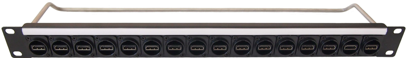
CP30174 - 1U Panel loaded with 16 x HDMI A-A Connectors. M3 Holes. Front mounted