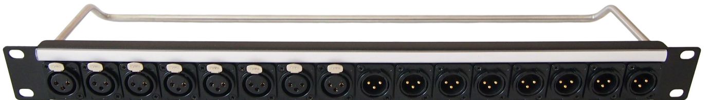
CP30183 - 1U Panel loaded with 8 x XLR 3DCF + 8 x XLR 3DCM. M3 Holes. Front mounted. Solder tag.