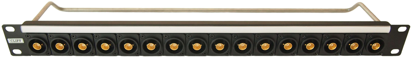
CP30186 - 1U Panel loaded with 16 x Gold BNC 75Ω 12GHz, M3 Holes. Front mounted

For further information, contact sales@cliffuk.co.uk