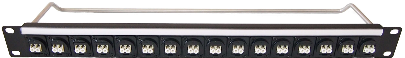
CP30180 - 1U Panel loaded with 16 x LC Duplex MM Connectors. M3 Holes. Front mounted