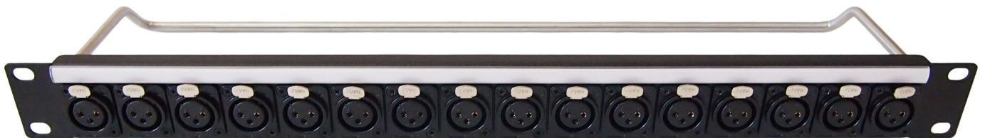
CP30182 - 1U Panel loaded with 16 x XLR 3DCF . M3 Holes. Front mounted. Solder tag at rear.