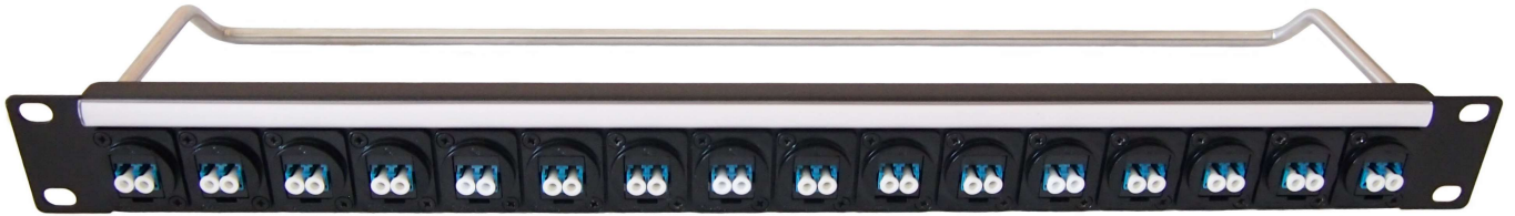
CP30179 - 1U Panel loaded with 16 x LC Duplex SM Connectors. M3 Holes. Front mounted