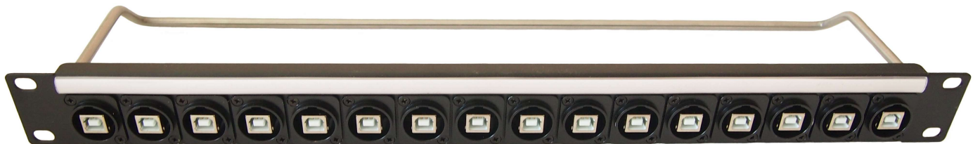
CP30176 - 1U Panel loaded with 16 x USB2 B-A Connectors. M3 Holes. Front mounted