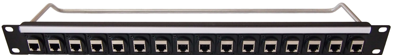
CP30177 - 1U Panel loaded with 16 x CAT6A Connectors. M3 Holes. Front mounted