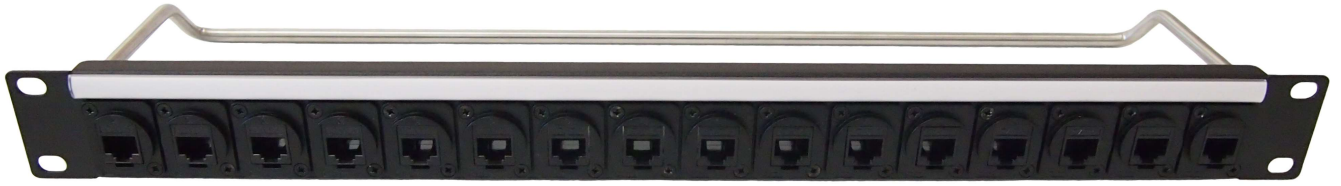
CP30172 - 1U Panel loaded with 16 x CAT6 RJ45 Connectors. #4-40 holes. Front mounted CP30173 - 1U Panel loaded with 16 x CAT6 RJ45 Connectors. M3 holes. Front mounted