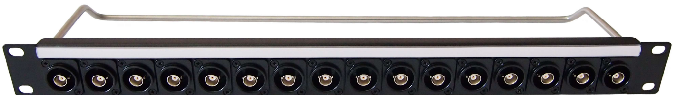
CP30184 - 1U Panel loaded with 16 x 50Ω Insulated BNC Connectors. M3 Holes. Front mounted