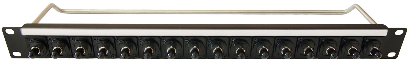
CP30178 - 1U Panel loaded with 16 x ST Fibre Connectors. M3 Holes. Front mounted