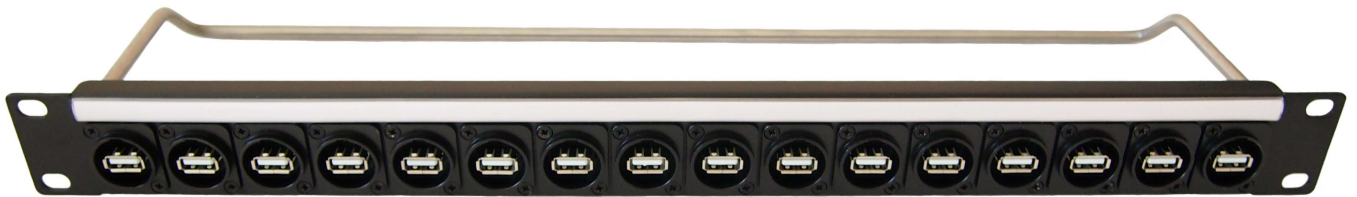
CP30175 - 1U Panel loaded with 16 x USB2 A-B Connectors. M3 Holes. Front mounted