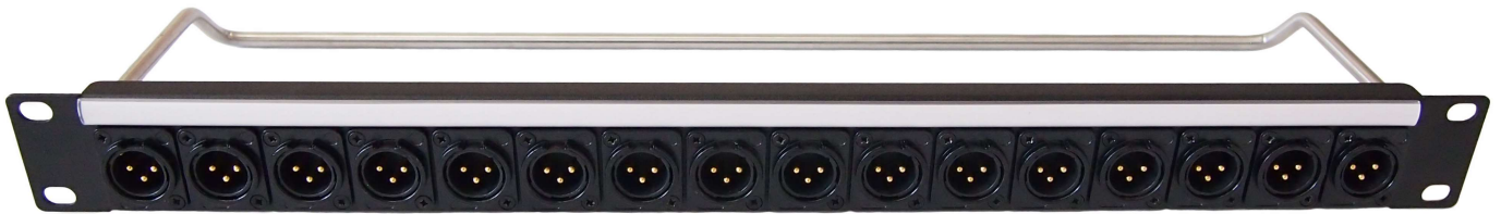
CP30181 - 1U Panel loaded with 16 x XLR 3DCM . M3 Holes. Front mounted. Solder tag at rear.