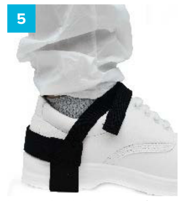
Inspect the Heel grounder for a secure and comfortable fit by gently tugging on the straps.