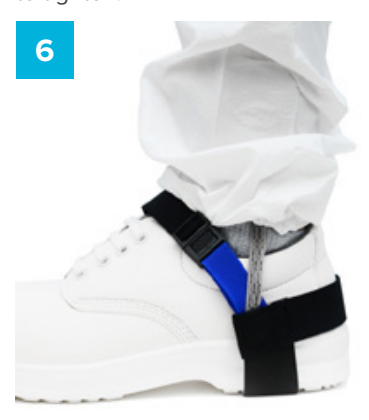
The footwear is now ready to be tested before entering a static sensitive area. Repeat with other shoe.

To request a quotation or for more information, please call +44 (0)1473 836200 email sales@antistat.com or visit www.antistat.com