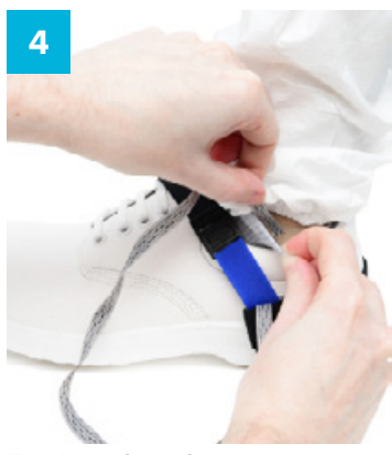
Feed the Grey Conductive Ribbon into the sock or shoe to complete the grounding path.