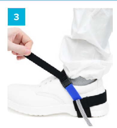
Push the Clip Fastener together to lock in place and pull the tail of the Black Elastic Strap to tighten.