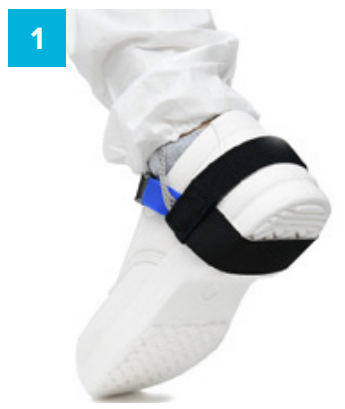
Remove Heel Grounder from its packaging and place the Black Conductive Rubber Strip on the heel grip of the shoe.