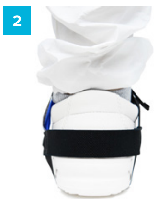
Place the Black Elastic Strip at the back of the shoe.