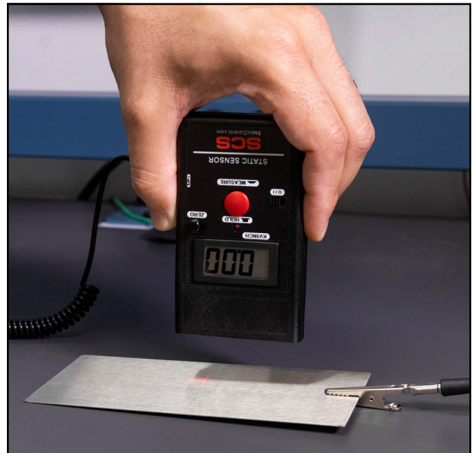
Figure 6. Pointing the Static Sensor to a grounded surface

Slide the power switch to the right to power the Static Sensor. Point the top of the Static Sensor approximately 1 inch (2.5 cm) away from a grounded metal surface. Proper spacing is indicated when the two red bullseyes emitted LED range indicator become centered on top of each other. Turn the rotary zero knob until the Static Sensor's display reads 0.00.