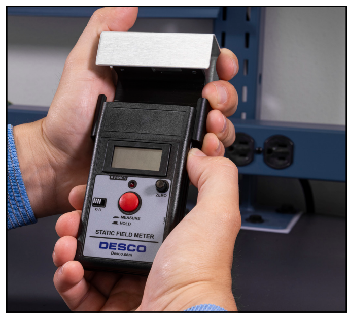
Figure 8. Sliding the Conductive Plate onto the Digital Static Field Meter