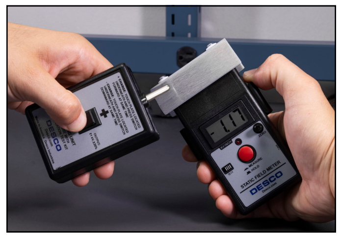
Figure 10. Using the Charger to apply a charge onto the Conductive Plate

NOTE: A ground path must be provided between the touch plate of the Charger and the ground reference of the Digital Static Field Meter. This is normally provided by holding the Charger in one hand and the Digital Static Field Meter with Conductive Plate in the other.