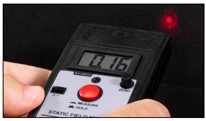
Figure 7. Aligning the two bullseyes emitted by the LED range indicator