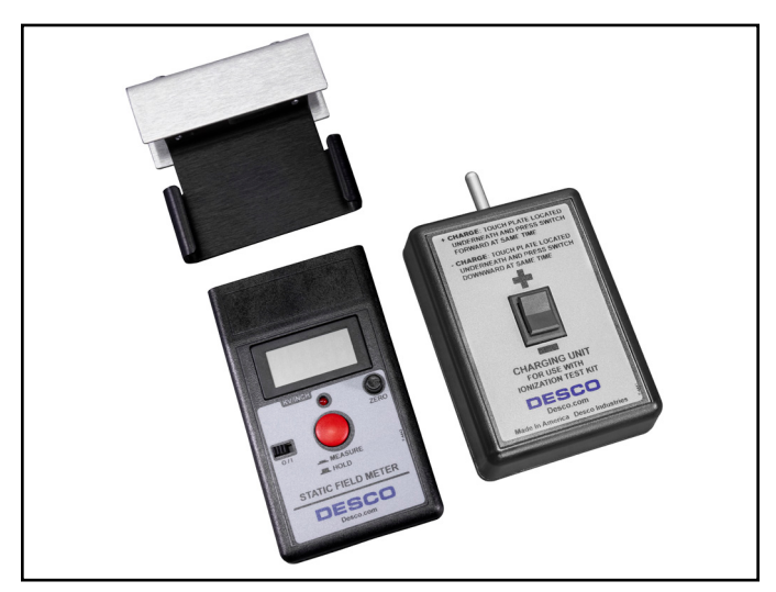
Figure 2. Desco 19443 Air Ionization Test Kit