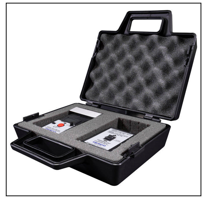
Figure 3. Air Ionization Test Kit and Carrying Case