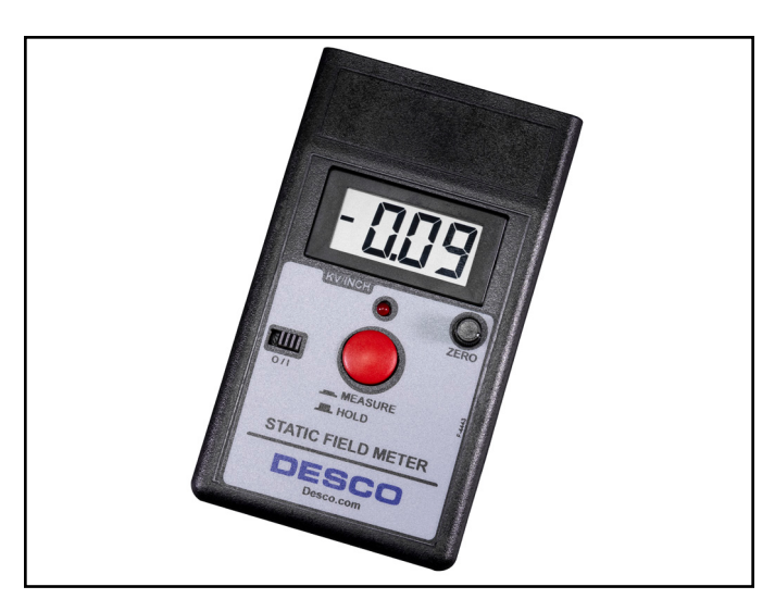
Figure 1. Desco 19442 Digital Static Field Meter