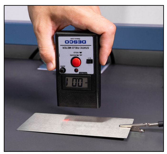
Figure 6. Pointing the Digital Static Field Meter to a arounded surface

Slide the power switch to the right to power the Digital Static Field Meter. Point the top of the Digital Static Field Meter approximately 1 inch (2.5 cm) away from a grounded metal surface. Proper spacing is indicated when the two red bullseyes emitted LED range indicator become centered on top of each other. Turn the rotary zero knob until the Digital Static Field Meter's display reads 0.00.