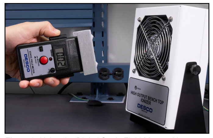
Figure 9. Using the Digital Static Field Meter with Conductive Plate to measure the offset voltage of a benchtop ionizer

NOTE: When testing pulsed ionizer systems, the voltage displayed is constantly changing. This pulse rate may be faster than the display update rate of the Digital Static Field Meter, therefore the displayed voltage is an average of the actual voltage. The output of the Digital Static Field Meter is useful in this situation for more accurate measurements.