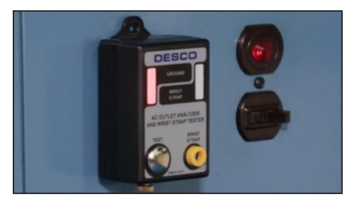
Figure 6. Verifying a properly wired AC outlet

The Ground LED will illuminate red and the audible alarm will sound if the outlet's wiring is incorrect or the path to equipment ground via the equipment grounding conductor is not intact.