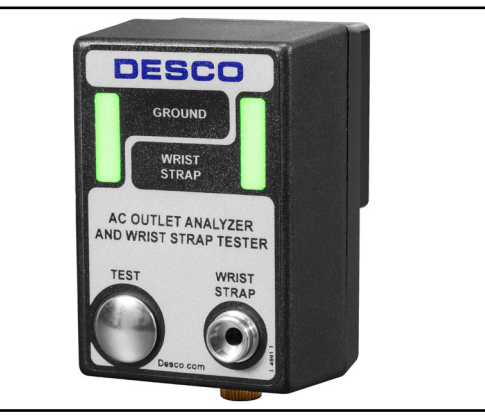
Figure 2. Desco 98134 AC Outlet Analyzer and Wrist Strap Tester

Figure 1. Desco 98133 AC Outlet Analyzer and Wrist Strap Tester