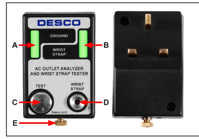
Figure 4. 98134 AC Outlet Analyzer and Wrist Strap Tester features and components

A. Ground LED: Illuminates green when the AC outlet is properly wired and its path to equipment ground via the equipment ground conductor is intact. Illuminates red and audible alarm sounds when the AC outlet is not properly wired and its path to equipment ground via the equipment ground conductor is broken.