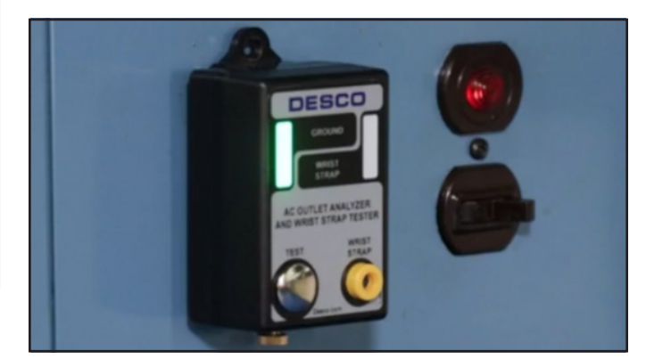
Figure 5. Verifying a properly wired AC outlet

The Ground LED will illuminate red and the audible alarm will sound if the outlet's wiring is incorrect or the path to equipment ground via the equipment grounding conductor is not intact.