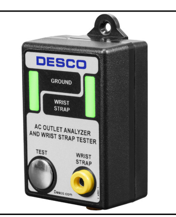
Figure 1. Desco 98133 AC Outlet Analyzer and Wrist Strap Tester