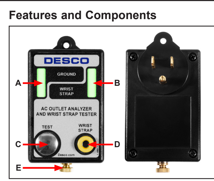
Figure 3. 98133 AC Outlet Analyzer and Wrist Strap Tester features and components