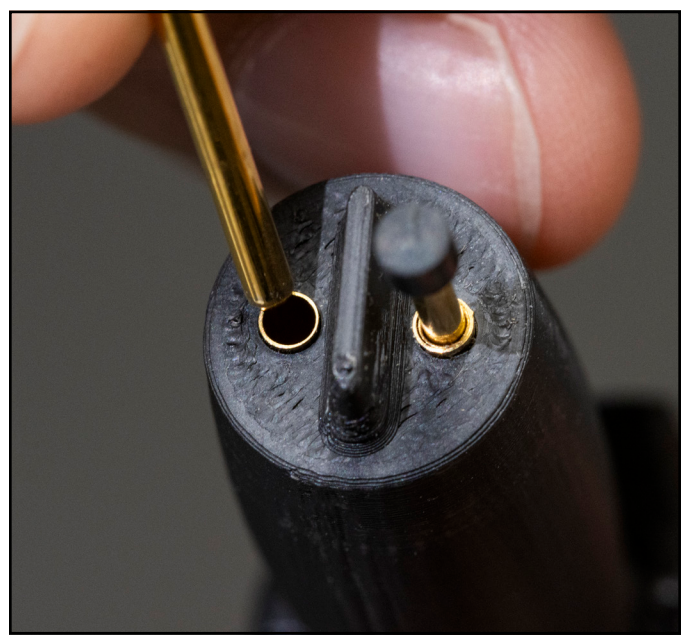
Figure 5. Replacing the spring-loaded pins

Two replacement pins are included should the ones installed in the probe become bent or damaged. Simply pull out the damaged pins from probe by hand and insert the replacements. Compress the pins into their sockets until they are level with one another.