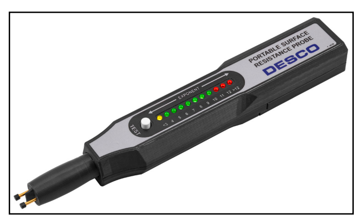
Figure 1. Desco 19301 Portable Surface Resistance Probe