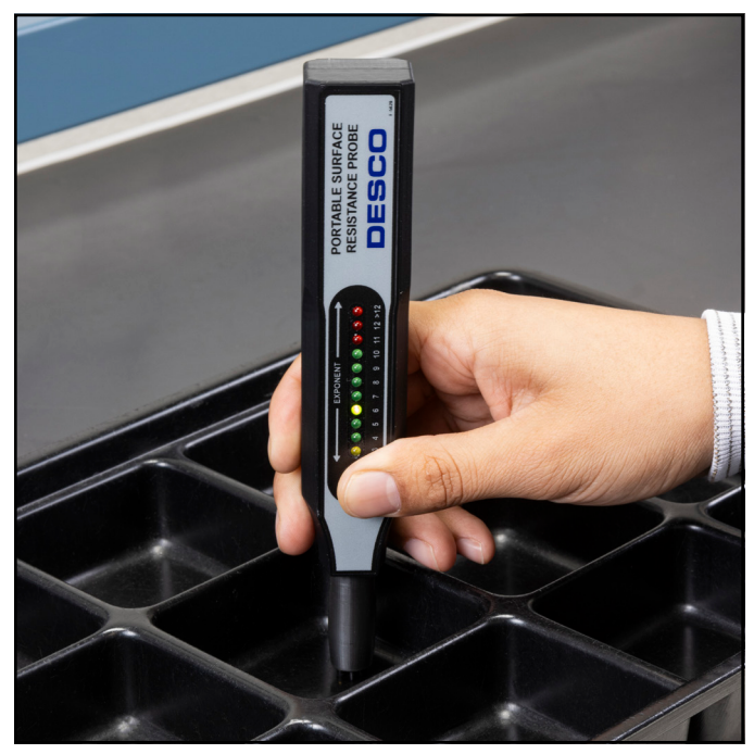
Figure 4. Using the Portable Surface Resistance Probe

4. Press the TEST button until the measurement illuminates a single LED on the probe.