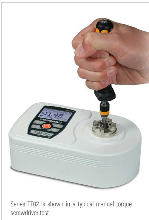
Series TT02 is shown in a typical manual torque screwdriver test

Series TT02 Torque Tool Testers present a simple and accurate solution for testing manual, electric, and pneumatic torque screwdrivers, wrenches, and other tools. These testers are compact and rugged, suitable for production environments. A universal 3/8" square receptacle accepts common bits and attachments. The TT02 captures peak torque in both measurement directions, and also calculates 1st and 2nd peaks, useful for click-type tools.