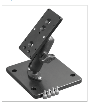
AC1100 Tabletop stand for indicator

Conveniently positions the indicator for easy viewing. Includes thumb screws to for indicator installation and thru holes for bench mounting.