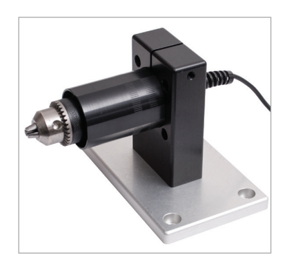
AC1007 Tabletop stand for sensor

Conveniently positions the indicator for easy viewing. Includes thumb screws to for indicator installation and thru holes for bench mounting.