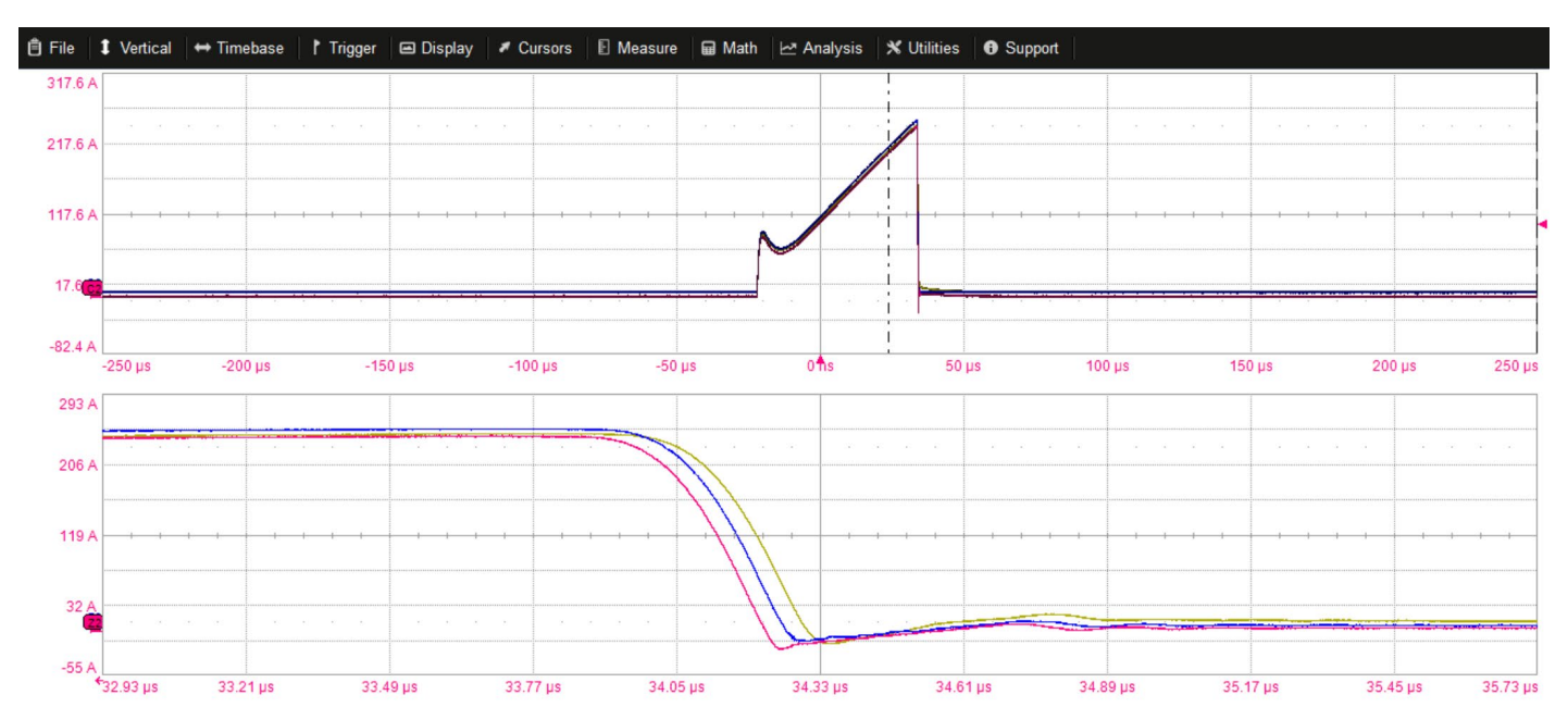
Comparison of three Teledyne Test Tools Rogowski probes. The probes have been offset to enable comparison.