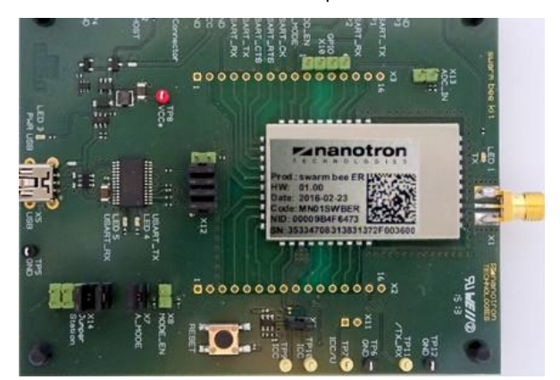
swarm bee ER DK Plus Board