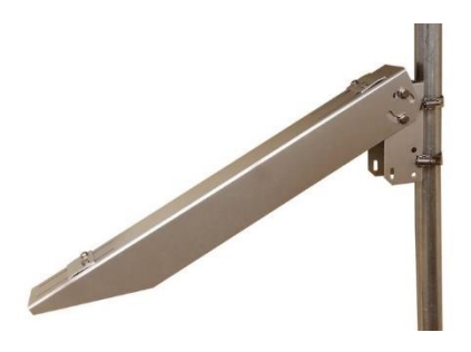
35W Solar Mount

Batteries are an Advance Glass Matt (AGM) type which have good all temperature deep discharge performance.