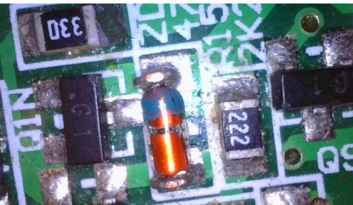
PCB as seen from a PM-40

Included in the package: Vividia PM-40 USB Microscope Borescope; Software for Windows "Vividia Ablescope Viewer"; Instruction; Metal Stands, side-viewing mirror (1 piece).