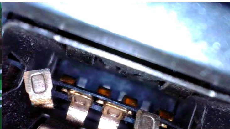
USB port as seen from a PM-40