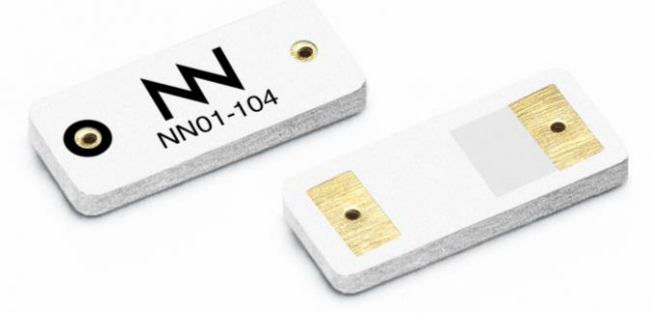
PAT US 7,148,850, US 7,202,822