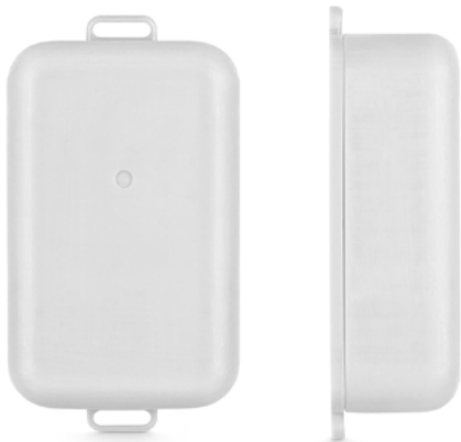
Dimensions: 88 x 48 x 26 mm

The small, durable transceiver tag features a deployment ready design that allows you to easily set up, activate and manage deployments that can scale across thousands of tracked assets.