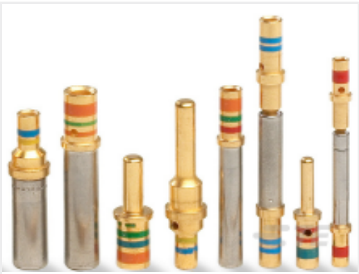
TE Part #4160-202-2031L CONT PIN