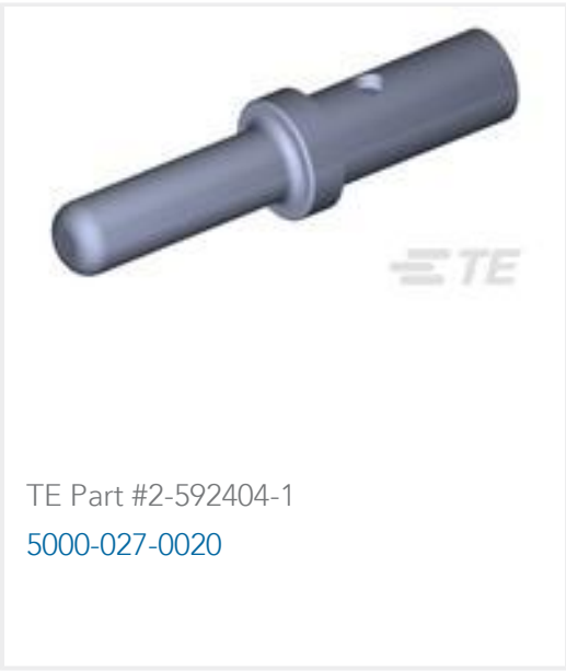
TE Part #2-592404-1 5000-027-0020