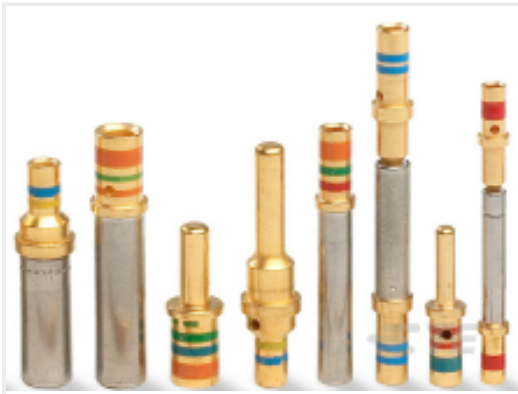
TE Part #4162-201-1631L CONT SOC ASSY