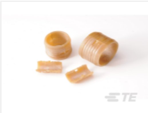
TE Part #EM6343-000 R85049/93-08