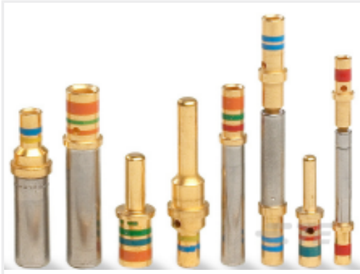
TE Part #0004-058-100L CONT PIN