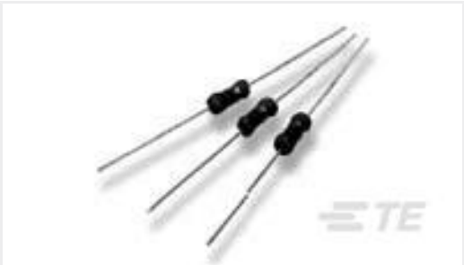
TE Part #4-1879351-3 RR01 5% 160K AMMO