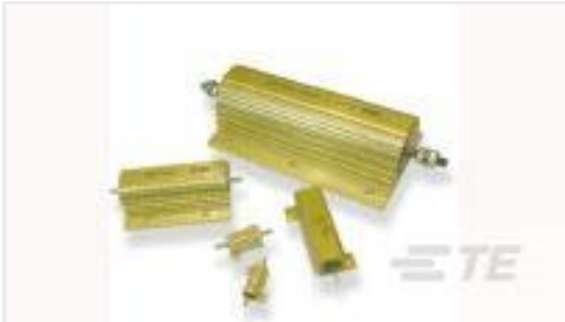
TE Part #2-1676625-3 HSA25 48R 5%