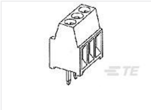
TE Part #282834-7 TERMI-BLOK PCB MOUNT, 90 7P.