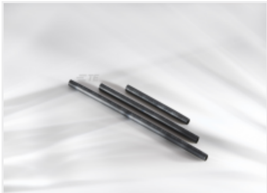
TE Part #206247P038 SCT-NO.4-E2-0-STK