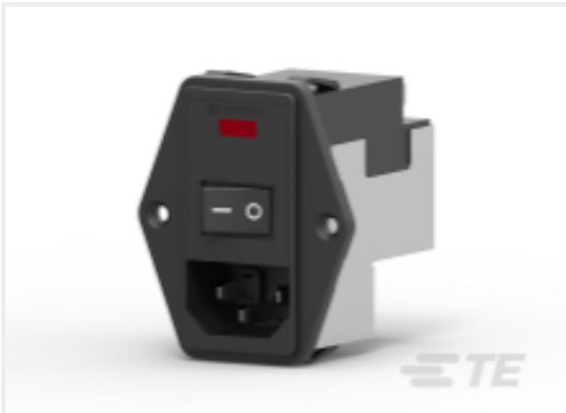
TE Part #2-6609104-5 PE0S0DSXA=C1291