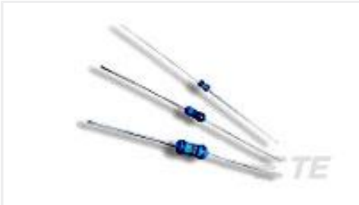
TE Part #6-1622796-9 YR1 0.1% 162K