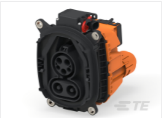
TE Part #2430432-2 COMBO 1,CHARGE INLET KIT 120SQMM,W/O LED