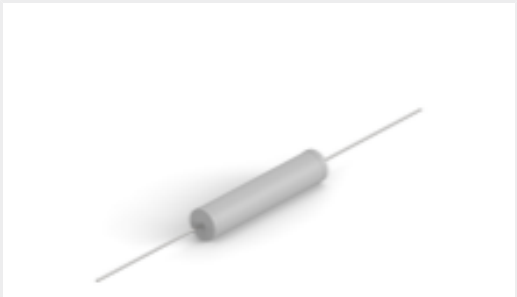
TE Part #9-2176415-1 8W STD M/OX 5% 160K