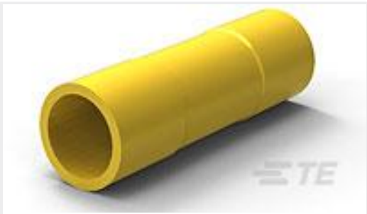
TE Part #34136 SPLICE,PG PARA 12-10