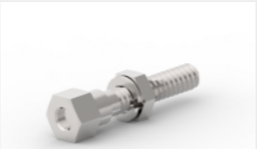
TE Part #2-1437012-8 609-007-1=HDW IDC JACKSOCKET A