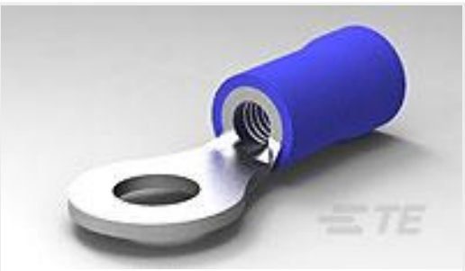
TE Part #34160 TERMINAL,PG R 16-14 8