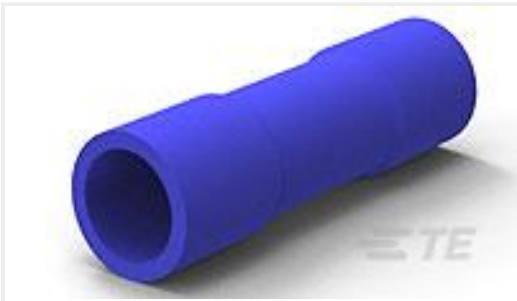
TE Part #34134 SPLICE,PG PARA 16-14