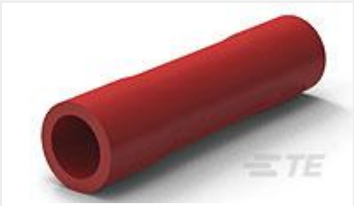
TE Part #34132 SPLICE,PG PARA 22-16