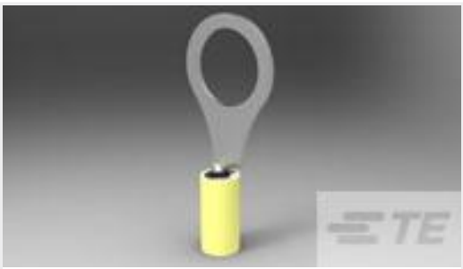
TE Part #160298 PIDG RING 12-10 5/16