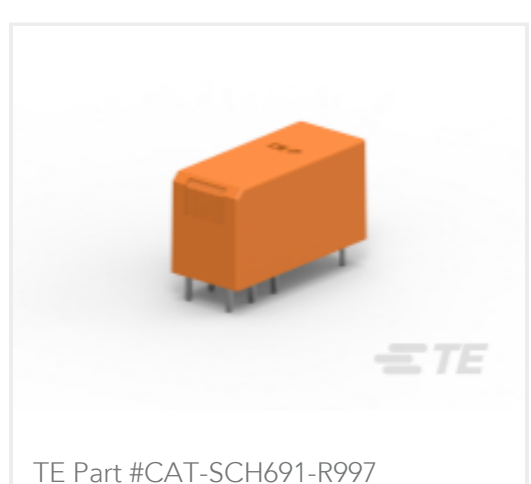
TE Part #CAT-SCH691-R997 PCB Power Relay: 12-16 Amp, Monostable