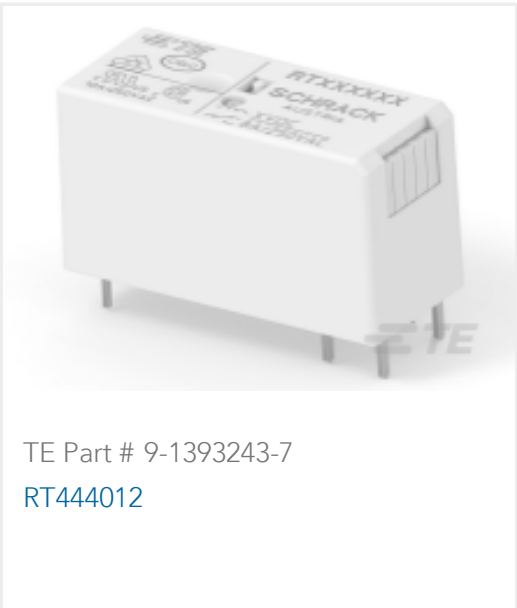
TE Part # 9-1393243-7 RT444012