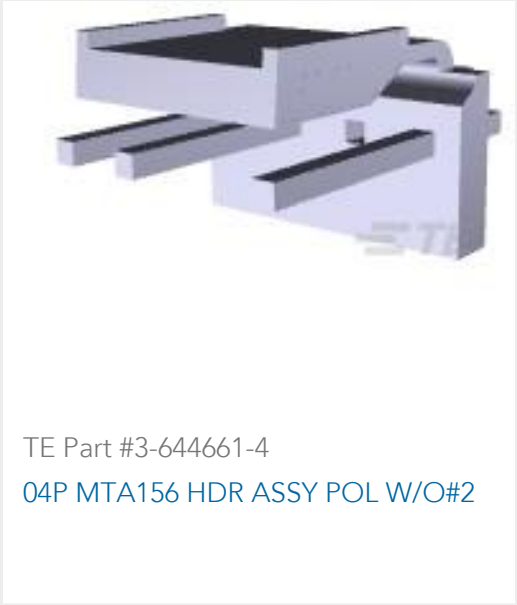
TE Part #3-644661-4 04P MTA156 HDR ASSY POL W/O#2