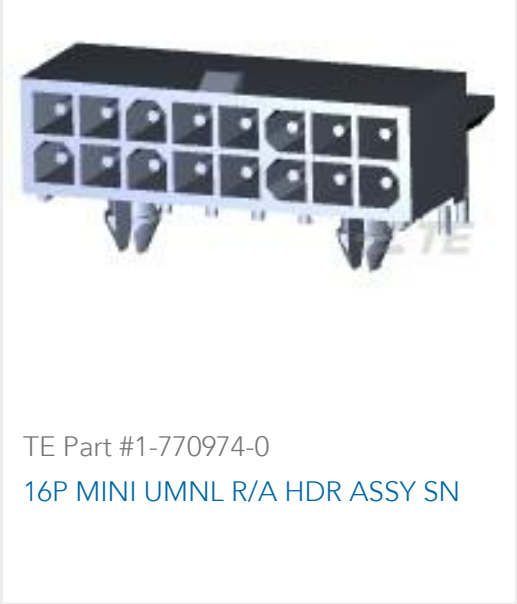
TE Part #1-770974-0 16P MINI UMNL R/A HDR ASSY SN