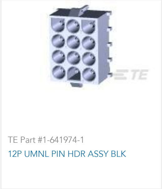
TE Part #1-641974-1 12P UMNL PIN HDR ASSY BLK