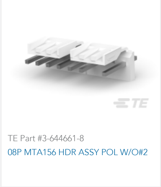
TE Part #3-644661-8 08P MTA156 HDR ASSY POL W/O#2