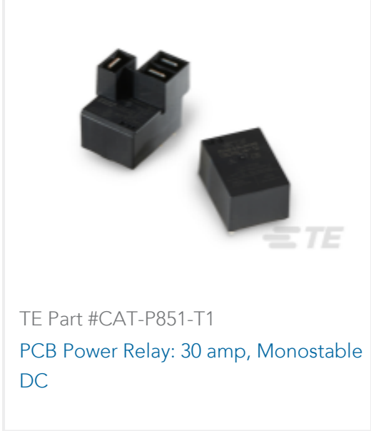
TE Part #CAT-P851-T1 PCB Power Relay: 30 amp, Monostable DC