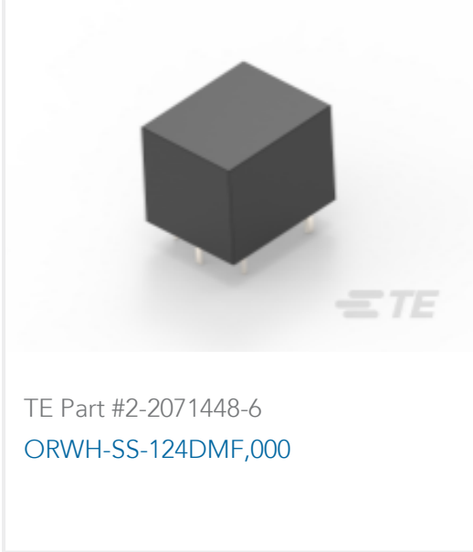
TE Part #2-2071448-6 ORWH-SS-124DMF,000