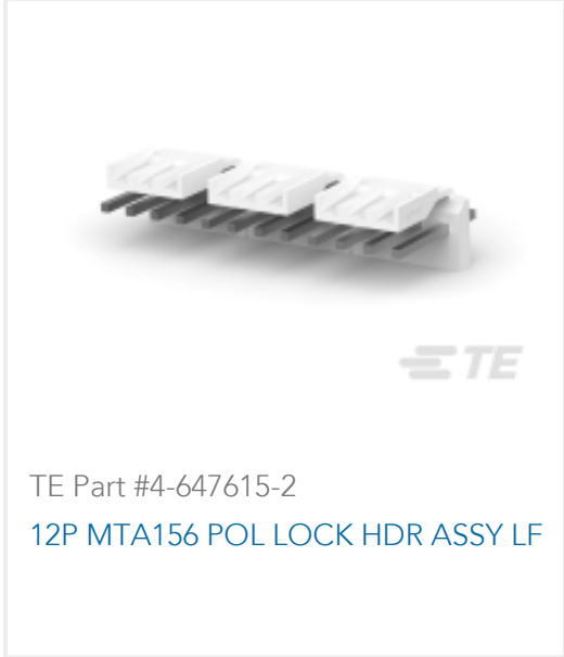
TE Part #4-647615-2 12P MTA156 POL LOCK HDR ASSY LF