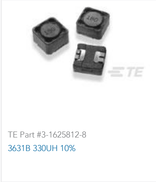
TE Part #3-1625812-8 3631B 330UH 10%