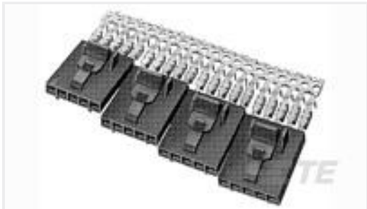
TE Part #5-103958-1 10X2 MTE RPT SR LATCH .100CL