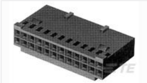
TE Part #87631-5 10 MODIV HSG COMP DR .100 POL