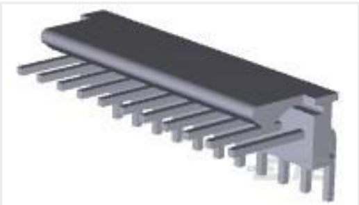
TE Part #1-640457-1 11P MTA100 HDR ASSY SQ R/A F/L