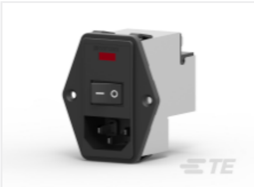
TE Part #2-6609104-9 PE0S0DSXB=C1302