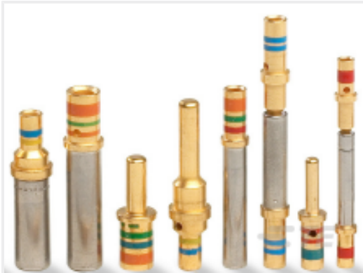
TE Part #2560-220-2031 CONT PIN