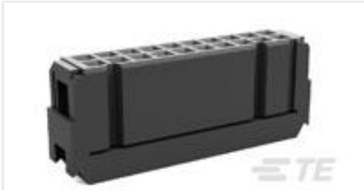
TE Part #1658620-9 40 NOVO MIL 15DP, LEAD FREE