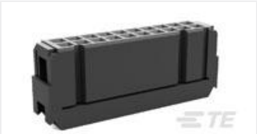
TE Part #1658620-3 16 NOVO MIL 15DP, LEAD FREE