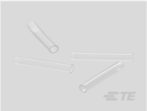
TE Part #NB17592001 RT-375-3/4-X-STK