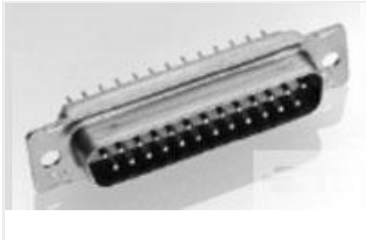
TE Part #1757820-4 AMPLIMITE,ASY,RCPT,STD,109,ZN,4