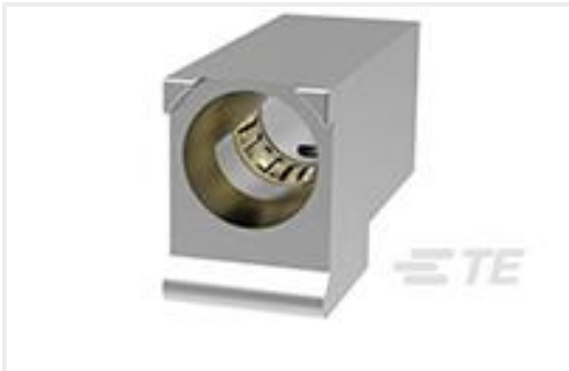
TE Part #2000713-2 RA Keyed Guide Mod. Vita 46, Machined