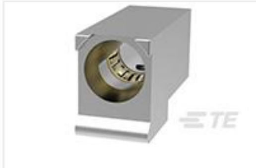
TE Part #2000713-1 RA Keyed Guide Mod, Vita 46, Machined