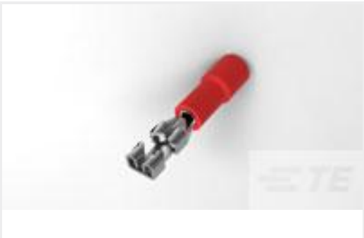
TE Part #640923-1 RECEPT,PIDG FASTON 22-18 110