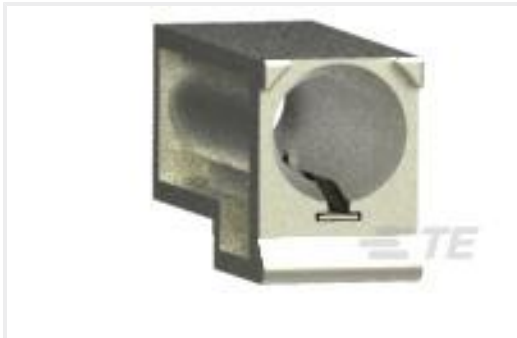
TE Part #1-1469492-9 MULTIGIG RT 9MM GUIDE/ESD UNKE