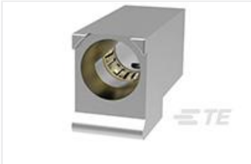
TE Part #2000713-3 RA Keyed Guide Mod, Vita 46, Machined