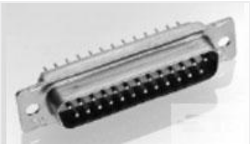
TE Part #1757823-9 AMPLIMITE,ASY,PLUG,STD,90,ZN,3,CT