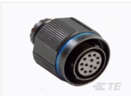
TE Part #YDTS26W21-41SBV001 PLUG ASSY