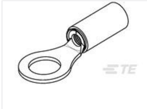
TE Part #1577649-1 TERMINAL RT PIDG PEEK STRATO 10 AWG