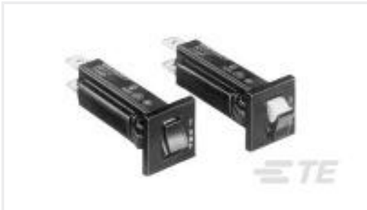
TE Part #3-1393250-4 W28-XQ1A-3=W28-