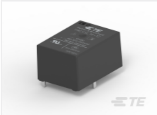
TE Part #1558667-7 T9GS2L14-24