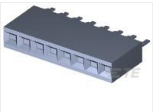
TE Part #534237-6 08 MODII VRT SR CE 100/115