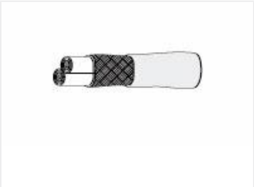
TE Part #811607-000 55A1121-18-9/96-9CS2275