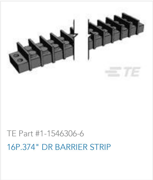
TE Part #1-1546306-6 16P.374" DR BARRIER STRIP