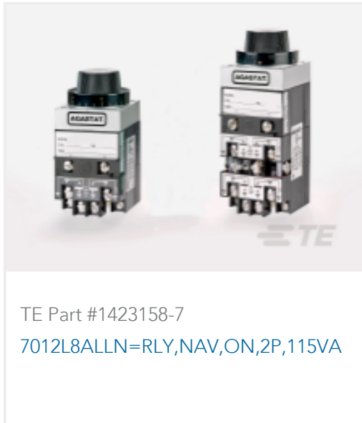
TE Part #1423158-7 7012L8ALLN=RLY,NAV,ON,2P,115VA