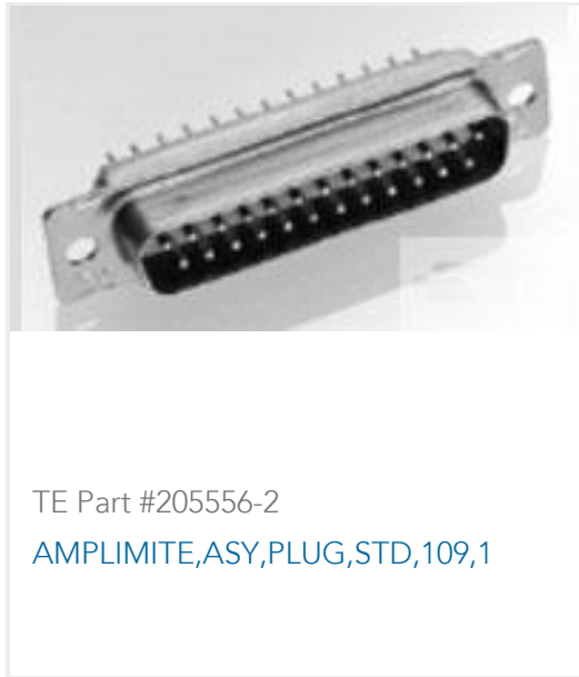
TE Part #205556-2 AMPLIMITE,ASY,PLUG,STD,109,1