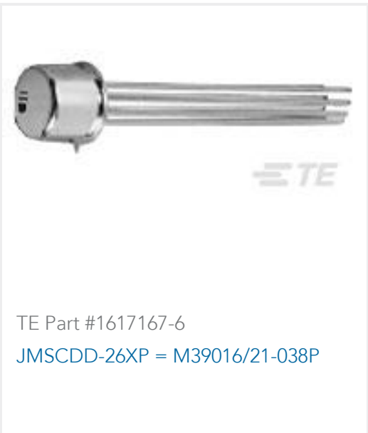
TE Part #1617167-6 JMSCDD-26XP = M39016/21-038P