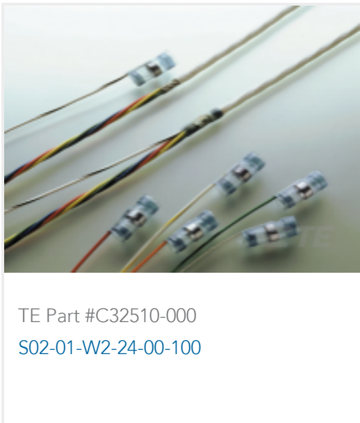
TE Part #C32510-000 S02-01-W2-24-00-100