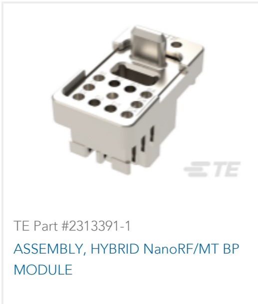
TE Part #2313391-1 ASSEMBLY, HYBRID NanoRF/MT BP MODULE