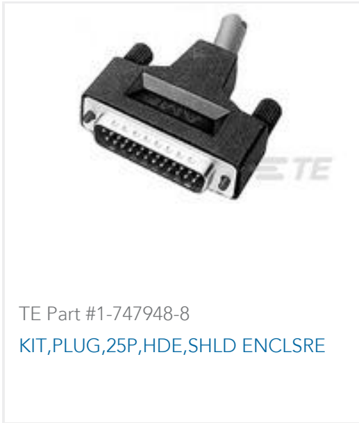
TE Part #1-747948-8 KIT,PLUG,25P,HDE,SHLD ENCLSRE