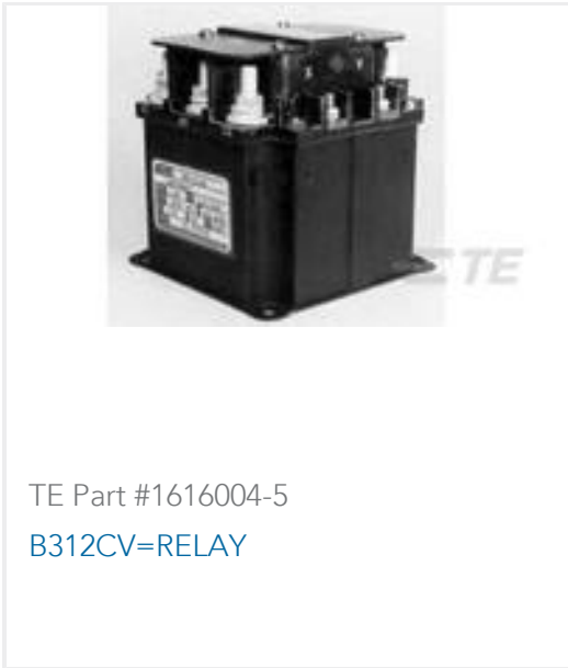
TE Part #1616004-5 B312CV=RELAY