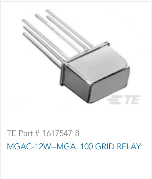
TE Part # 1617547-8 MGAC-12W=MGA .100 GRID RELAY