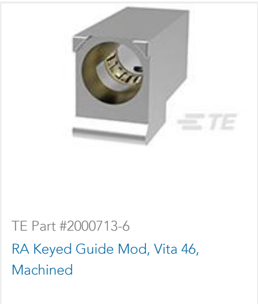
TE Part #2000713-6 RA Keyed Guide Mod, Vita 46, Machined