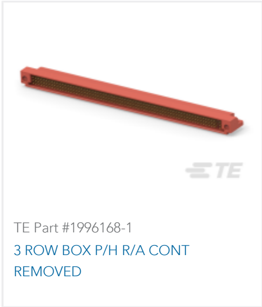
TE Part #1996168-1 3 ROW BOX P/H R/A CONT REMOVED