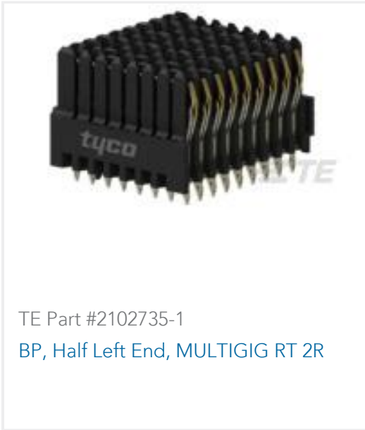
TE Part #2102735-1 BP, Half Left End, MULTIGIG RT 2R