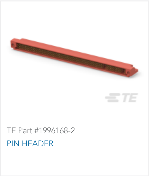
TE Part #1996168-2 PIN HEADER