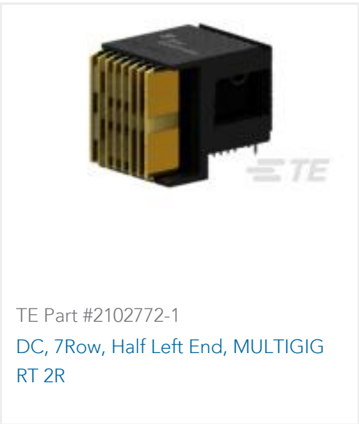
TE Part #2102772-1 DC, 7Row, Half Left End, MULTIGIG RT 2R