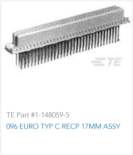
TE Part #1-148059-5 096 EURO TYP C RECP 17MM ASSY