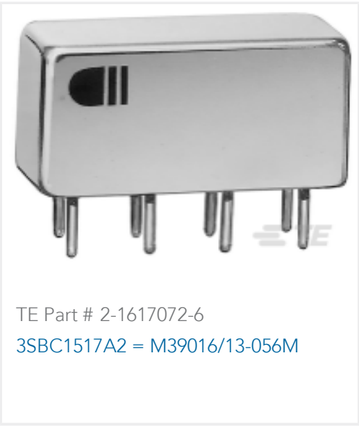
TE Part # 2-1617072-6 3SBC1517A2 = M39016/13-056M