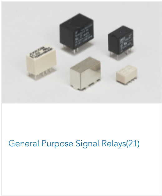
General Purpose Signal Relays(21)