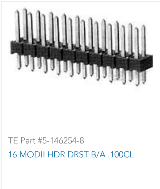
TE Part #5-146254-8 16 MODII HDR DRST B/A .100CL