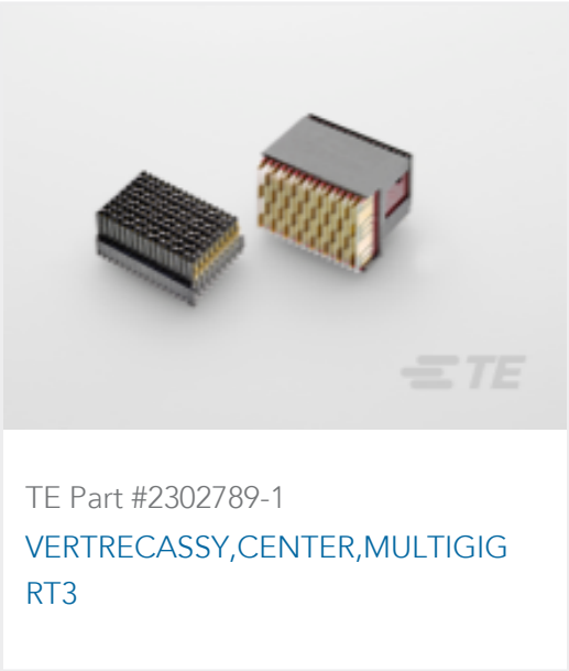
TE Part #2302789-1 VERTRECCASSY,CENTER,MULTIGIG RT3