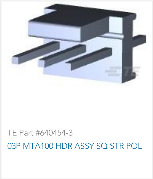
TE Part #640454-3 03P MTA100 HDR ASSY SQ STR POL