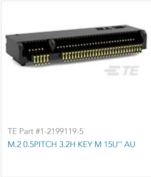
TE Part #1-2199119-5 M.2 0.5PITCH 3.2H KEY M 15U" AU