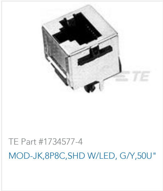
TE Part #1734577-4 MOD-JK,8P8C,SHD W/LED, G/Y,50U"