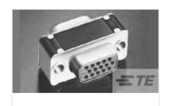
TE Part #211010-4 CONN SAVER,15 POSN,AMPLIMITE