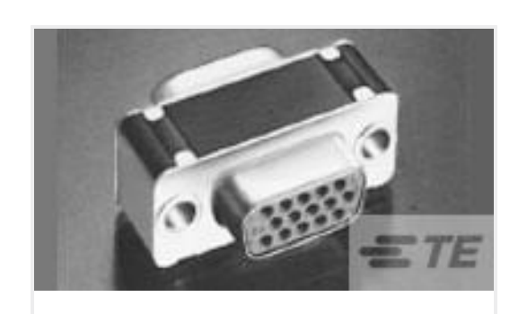
TE Part #211012-4