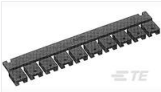
TE Part #531230-3 SHUNT, .200 C/L, LP, 2 POS 30AU