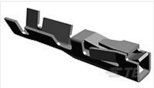
TE Part #166500-2 TANDEM SPRING REC